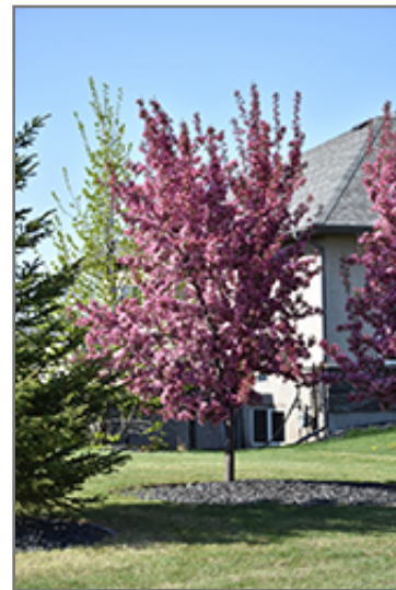
Thunderchild Flowering Crab in bloom

Thunderchild Flowering Crab is a deciduous tree with an upright spreading habit of growth. Its average texture blends into the landscape, but can be balanced by one or two finer or coarser trees or shrubs for an effective composition.