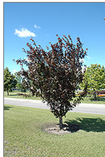
Thunderchild Flowering Crab

This tree should only be grown in full sunlight. It prefers to grow in average to moist conditions, and shouldn't be allowed to dry out. It is not particular as to soil type or pH. It is highly tolerant of urban pollution and will even thrive in inner city environments. This particular variety is an interspecific hybrid.