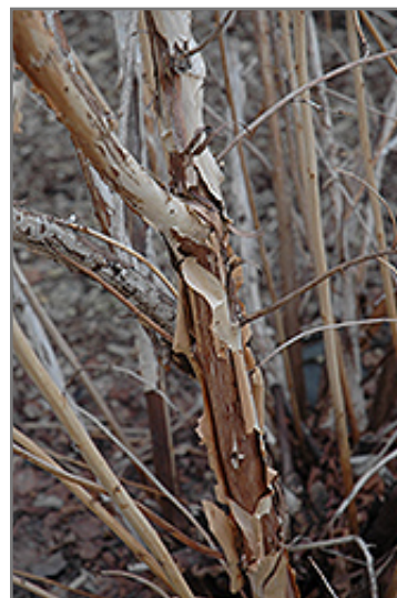
Dart's Gold Ninebark bark

This shrub does best in full sun to partial shade. It is very adaptable to both dry and moist locations, and should do just fine under average home landscape conditions. It is not particular as to soil type or pH. It is highly tolerant of urban pollution and will even thrive in inner city environments. This is a selection of a native North American species.