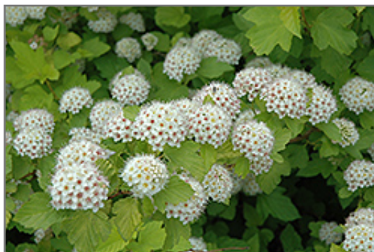
Dart's Gold Ninebark flowers

This shrub will require occasional maintenance and upkeep, and can be pruned at anytime. It has no significant negative characteristics.