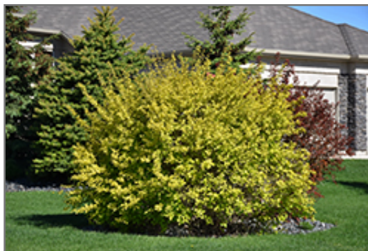
Dart's Gold Ninebark