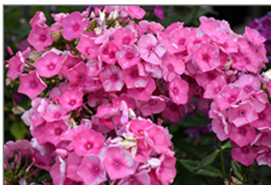
Bubble Gum Pink Garden Phlox flowers