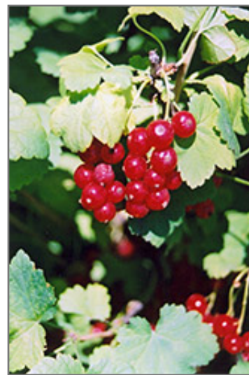
White Currant fruit

Aside from its primary use as an edible, White Currant is suitable for the following landscape applications;