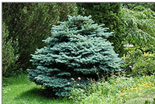
Blue Globe Spruce

Blue Globe Spruce will grow to be about 3 feet tall at maturity, with a spread of 4 feet. It tends to fill out right to the ground and therefore doesn't necessarily require facer plants in front. It grows at a slow rate, and under ideal conditions can be expected to live for 60 years or more.