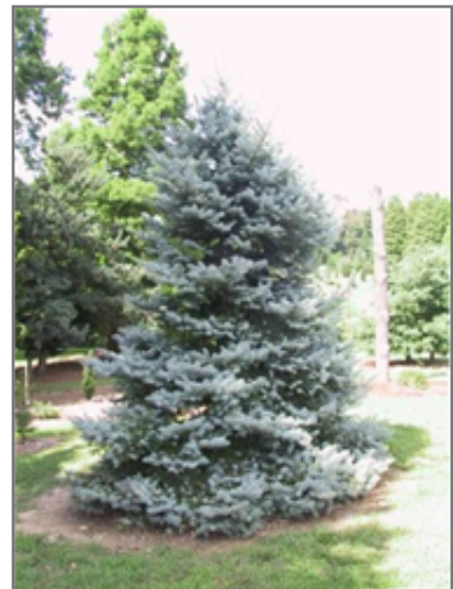
Bakeri Blue Spruce

Bakeri Blue Spruce is recommended for the following landscape applications;