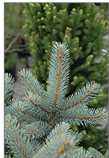
Bakeri Blue Spruce foliage