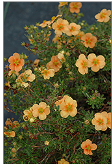
Orange Whisper Potentilla flowers

Orange Whisper Potentilla will grow to be about 3 feet tall at maturity, with a spread of 3 feet. It tends to fill out right to the ground and therefore doesn't necessarily require facer plants in front. It grows at a slow rate, and under ideal conditions can be expected to live for approximately 30 years.