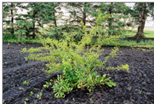
Sapalta Cherry-Plum