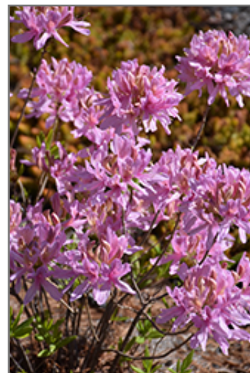
Orchid Lights Azalea flowers

Orchid Lights Azalea is recommended for the following landscape applications;