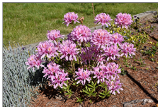
Orchid Lights Azalea in bloom