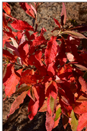
Rosy Lights Azalea in fall

This plant is not reliably hardy in our region, and certain restrictions may apply; contact the store for more information.