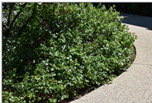
Gro-Low Sumac