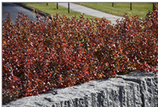
Gro-Low Sumac in fall

* This is a 'special order' plant - contact store for details