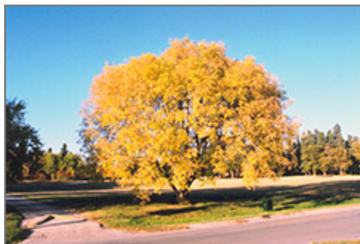
Boxelder in fall