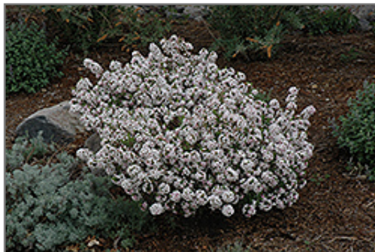
Rose Daphne in bloom

Rose Daphne will grow to be about 24 inches tall at maturity, with a spread of 3 feet. It tends to fill out right to the ground and therefore doesn't necessarily require facer plants in front. It grows at a slow rate, and under ideal conditions can be expected to live for approximately 20 years.