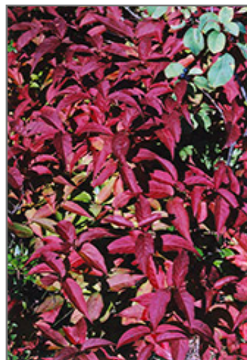
Dwarf Bush Honeysuckle in fall

This shrub does best in full sun to partial shade. It is very adaptable to both dry and moist locations, and should do just fine under typical garden conditions. It is not particular as to soil type or pH. It is highly tolerant of urban pollution and will even thrive in inner city environments. This species is native to parts of North America.