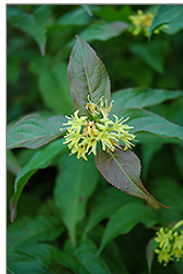
Dwarf Bush Honeysuckle flowers