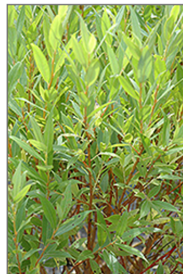
Flame Willow foliage