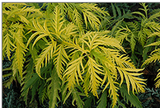
Sutherland Cutleaf Elder foliage

Sutherland Cutleaf Elder is recommended for the following landscape applications;