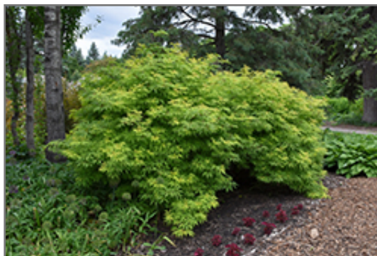
Sutherland Cutleaf Elder