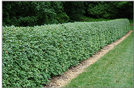
Winged Burning Bush

This shrub performs well in both full sun and full shade. It is very adaptable to both dry and moist locations, and should do just fine under average home landscape conditions. It is not particular as to soil type or pH. It is highly tolerant of urban pollution and will even thrive in inner city environments. This species is not originally from North America.