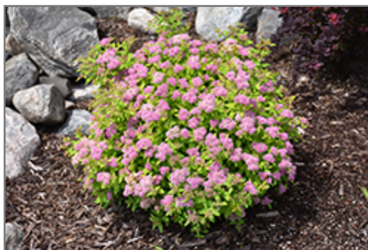
Dakota Goldcharm Spirea in bloom