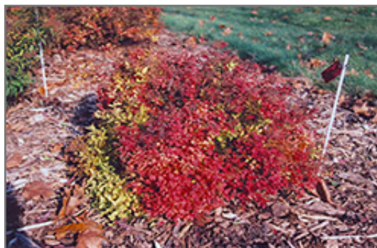
Dakota Goldcharm Spirea in fall

This shrub should only be grown in full sunlight. It prefers to grow in average to moist conditions, and shouldn't be allowed to dry out. It is not particular as to soil type or pH. It is highly tolerant of urban pollution and will even thrive in inner city environments. This is a selected variety of a species not originally from North America.