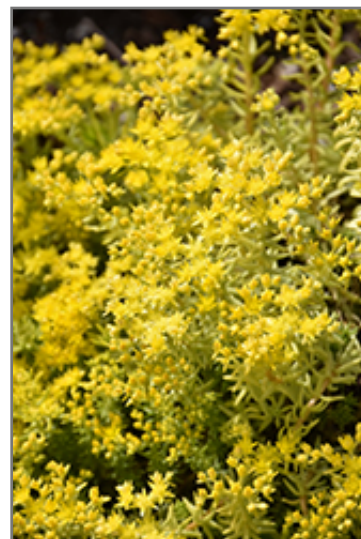
Lemon Ball Stonecrop flowers

This plant does best in full sun to partial shade. It prefers dry to average moisture levels with very well-drained soil, and will often die in standing water. It is considered to be drought-tolerant, and thus makes an ideal choice for a low-water garden or xeriscape application. It is not particular as to soil pH, but grows best in poor soils, and is able to handle environmental salt. It is highly tolerant of urban pollution and will even thrive in inner city environments. This is a selected variety of a species not originally from North America. It can be propagated by division; however, as a cultivated variety, be aware that it may be subject to certain restrictions or prohibitions on propagation.