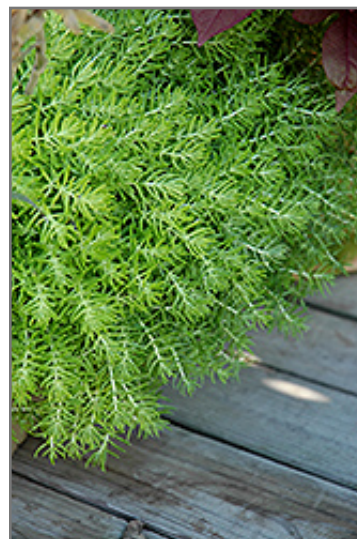
Lemon Ball Stonecrop foliage

Lemon Ball Stonecrop is a dense herbaceous perennial with a ground-hugging habit of growth. It brings an extremely fine and delicate texture to the garden composition and should be used to full effect.