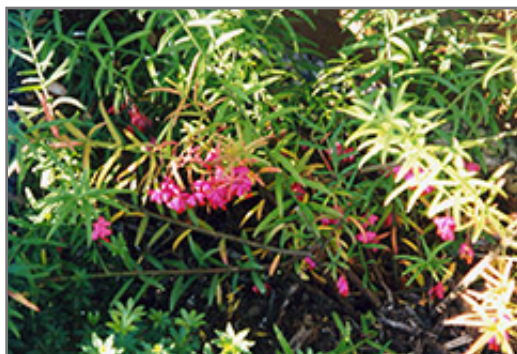
Turkistan Burning Bush flowers

This shrub performs well in both full sun and full shade. It is very adaptable to both dry and moist locations, and should do just fine under typical garden conditions. It is not particular as to soil type or pH. It is highly tolerant of urban pollution and will even thrive in inner city environments. This is a selected variety of a species not originally from North America.