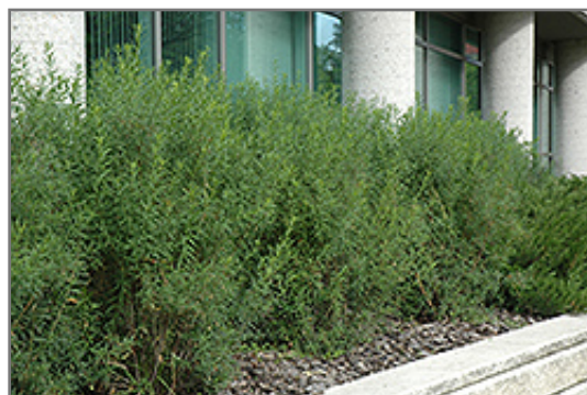
Turkistan Burning Bush