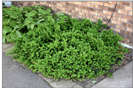
Emerald Spreader Yew

This shrub performs well in both full sun and full shade. It does best in average to evenly moist conditions, but will not tolerate standing water. It is not particular as to soil type or pH. It is highly tolerant of urban pollution and will even thrive in inner city environments, and will benefit from being planted in a relatively sheltered location. Consider applying a thick mulch around the root zone in winter to protect it in exposed locations or colder microclimates. This is a selected variety of a species not originally from North America, and parts of it are known to be toxic to humans and animals, so care should be exercised in planting it around children and pets.