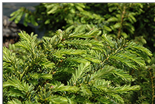
Emerald Spreader Yew foliage