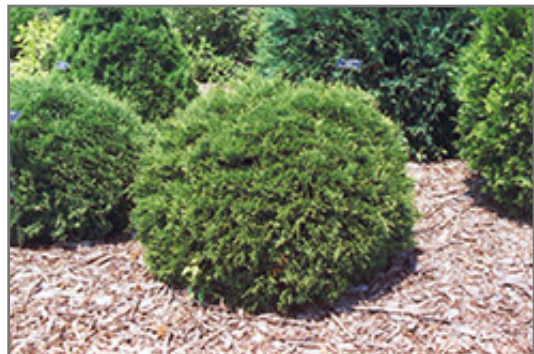
Hetz MidgeCedar