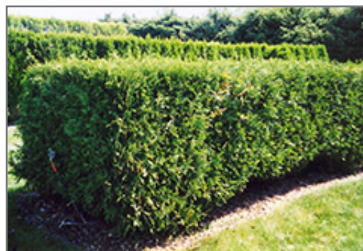
Techny Cedar