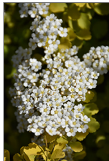
Glow Girl Spirea flowers