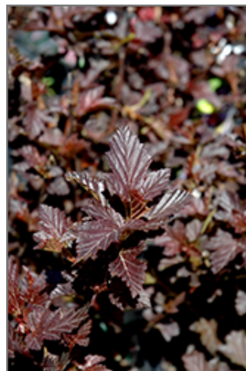
Burgundy Candy Ninebark foliage