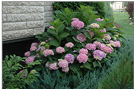
Endless Summer Hydrangea in bloom

* This is a 'special order' plant - contact store for details