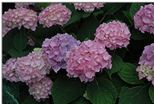
Endless Summer Hydrangea flowers