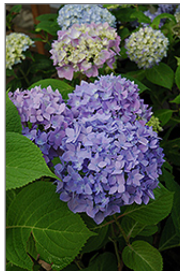
Endless Summer Hydrangea flowers