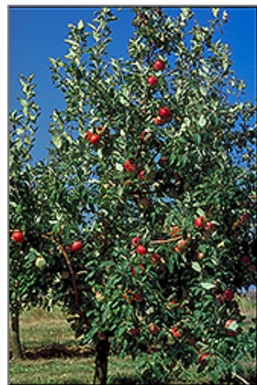
Zestar Apple fruit

This tree is typically grown in a designated area of the yard because of its mature size and spread. It should only be grown in full sunlight. It prefers to grow in average to moist conditions, and shouldn't be allowed to dry out. It is not particular as to soil type or pH. It is highly tolerant of urban pollution and will even thrive in inner city environments. This particular variety is an interspecific hybrid.