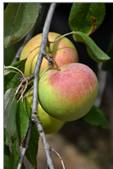
Zestar Apple fruit