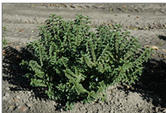
Pucker Up Red Twig Dogwood