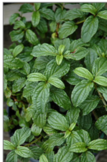
Pucker Up Red Twig Dogwood foliage

Pucker Up Red Twig Dogwood is a multi-stemmed deciduous shrub with an upright spreading habit of growth. Its average texture blends into the landscape, but can be balanced by one or two finer or coarser trees or shrubs for an effective composition.