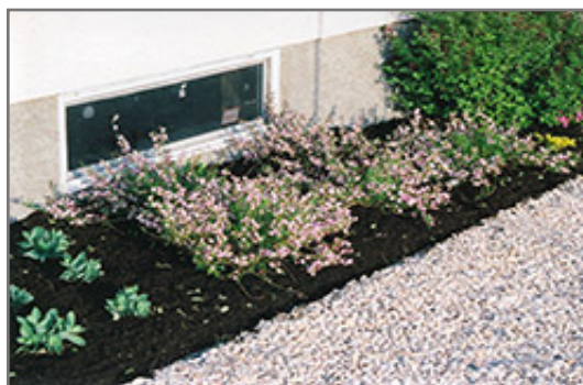
Purple Broom in bloom