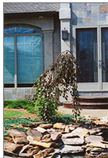
Royal Beauty Flowering Crab