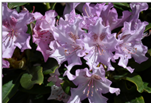
Pohjola's Daughter Rhododendron flowers