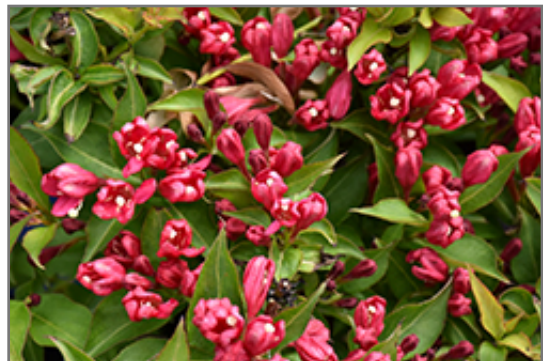
Crimson Kisses Weigela flowers