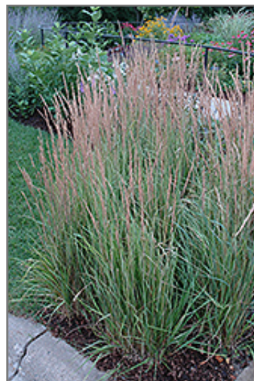
Variegated Reed Grass in bloom

Variegated Reed Grass is an herbaceous perennial grass with an upright spreading habit of growth. It brings an extremely fine and delicate texture to the garden composition and should be used to full effect.