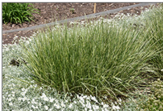
Variegated Reed Grass