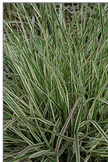
Variegated Reed Grass foliage