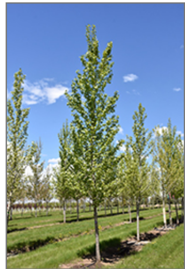
Byland Green Poplar