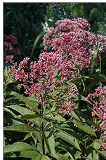
Gateway Joe Pye Weed flower buds

Gateway Joe Pye Weed is an herbaceous perennial with an upright spreading habit of growth. Its wonderfully bold, coarse texture can be very effective in a balanced garden composition.