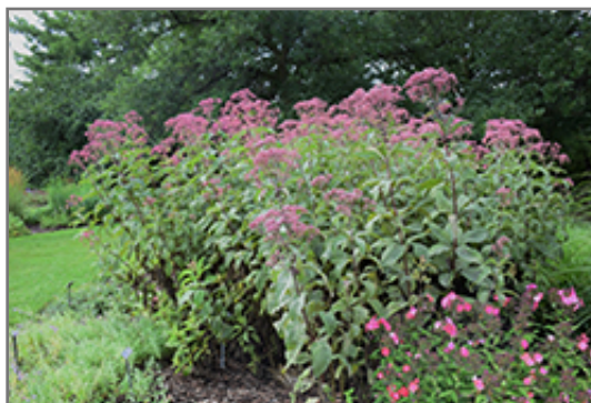
Gateway Joe Pye Weed in bloom