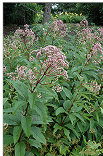
Gateway Joe Pye Weed flowers