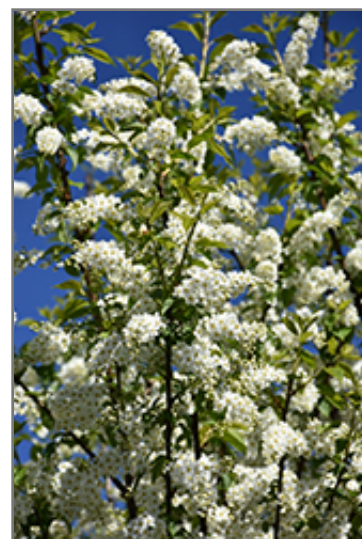
Bailey's Select Schubert Chokecherry flowers