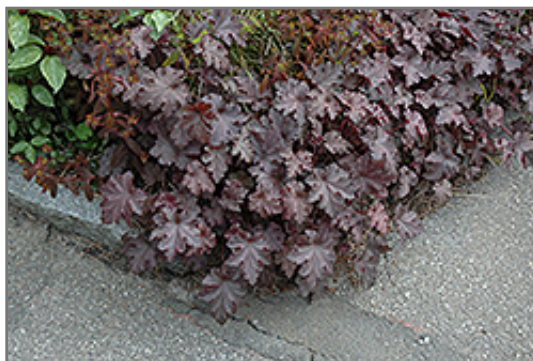
Stormy Seas Coral Bells

This is a relatively low maintenance plant, and should be cut back in late fall in preparation for winter. It is a good choice for attracting hummingbirds to your yard. It has no significant negative characteristics.