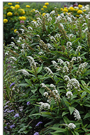
Gooseneck Loosestrife in bloom