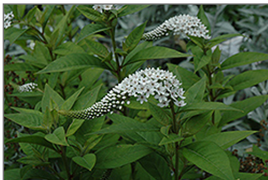
Gooseneck Loosestrife flowers

Gooseneck Loosestrife is recommended for the following landscape applications;