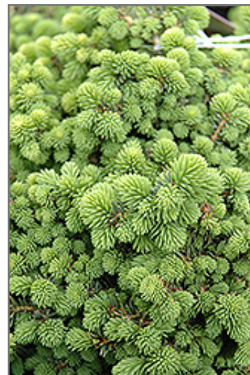
Little Gem Spruce foliage