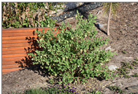
Boreal Blizzard Honeyberry in bloom