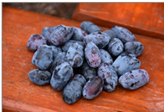
Boreal Blizzard Honeyberry fruit

Boreal Blizzard Honeyberry features subtle chartreuse flowers along the branches in early spring. It has green deciduous foliage. The narrow leaves do not develop any appreciable fall colour. It features an abundance of magnificent navy blue berries with powder blue overtones from early to mid summer.