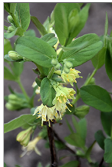
Boreal Blizzard Honeyberry flowers

This shrub is quite ornamental as well as edible, and is as much at home in a landscape or flower garden as it is in a designated edibles garden. It does best in full sun to partial shade. It prefers dry to average moisture levels with very well-drained soil, and will often die in standing water. It is not particular as to soil type or pH. It is highly tolerant of urban pollution and will even thrive in inner city environments. This is a selected variety of a species not originally from North America.