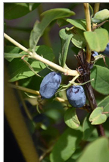
Polar Jewel Honeyberry fruit