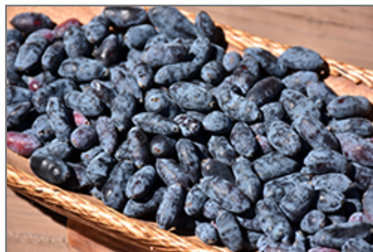
Polar Jewel Honeyberry fruit