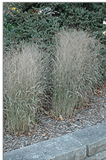
Shenandoah Reed Switch Grass in fall

This plant does best in full sun to partial shade. It is very adaptable to both dry and moist locations, and should do just fine under typical garden conditions. It is considered to be drought-tolerant, and thus makes an ideal choice for a low-water garden or xeriscape application. It is not particular as to soil type, but has a definite preference for alkaline soils, and is able to handle environmental salt. It is somewhat tolerant of urban pollution. This is a selection of a native North American species. It can be propagated by division; however, as a cultivated variety, be aware that it may be subject to certain restrictions or prohibitions on propagation.