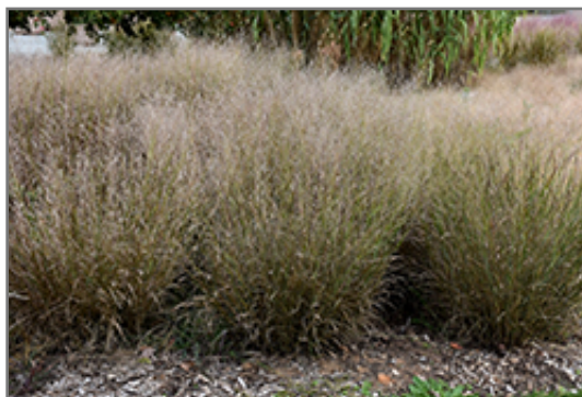
Shenandoah Reed Switch Grass fruit