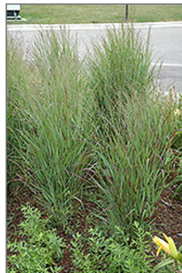
Shenandoah Reed Switch Grass