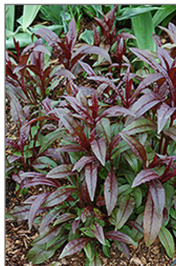
Husker Red Beard Tongue foliage