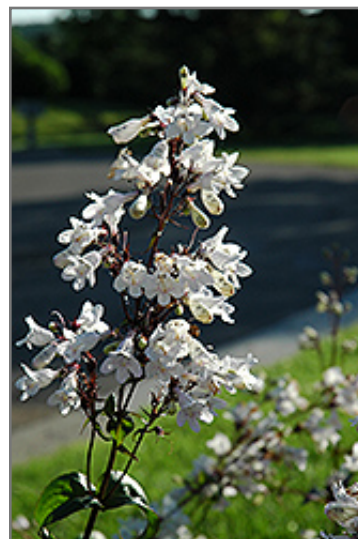
Husker Red Beard Tongue flowers

Husker Red Beard Tongue is recommended for the following landscape applications;