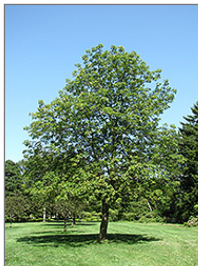
Ohio Buckeye