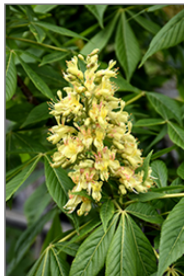
Ohio Buckeye flowers