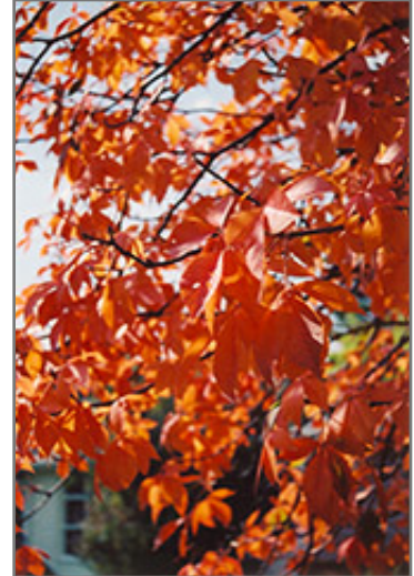
Ohio Buckeye in fall

This tree does best in full sun to partial shade. It prefers to grow in average to moist conditions, and shouldn't be allowed to dry out. It is not particular as to soil type or pH. It is highly tolerant of urban pollution and will even thrive in inner city environments. This species is native to parts of North America, and parts of it are known to be toxic to humans and animals, so care should be exercised in planting it around children and pets.