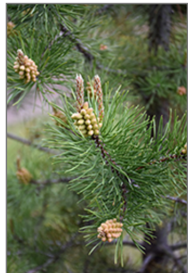
Lodgepole Pine foliage