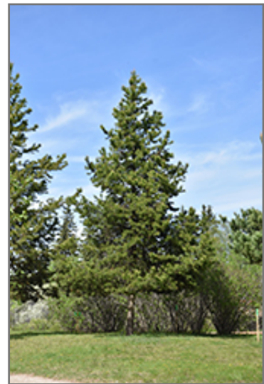
Lodgepole Pine