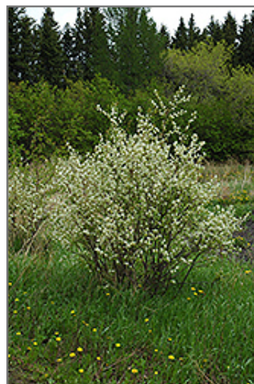
Honeywood Saskatoon in bloom