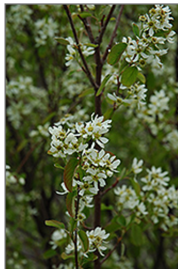
Honeywood Saskatoon flowers

Honeywood Saskatoon is blanketed in stunning clusters of white flowers rising above the foliage from early to mid spring before the leaves. It has dark green deciduous foliage. The oval leaves turn an outstanding yellow in the fall. It features an abundance of magnificent royal blue berries in early summer.