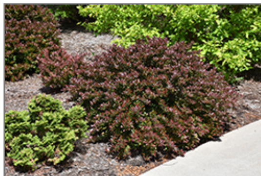
Concord Barberry