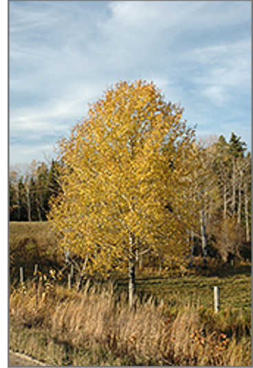
Trembling Aspen in fall

This tree should only be grown in full sunlight. It is an amazingly adaptable plant, tolerating both dry conditions and even some standing water. It is considered to be drought-tolerant, and thus makes an ideal choice for xeriscaping or the moisture-conserving landscape. It is not particular as to soil type or pH. It is quite intolerant of urban pollution, therefore inner city or urban streetside plantings are best avoided. This species is native to parts of North America.