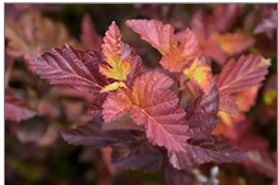
Centre Glow Ninebark foliage

Centre Glow Ninebark is recommended for the following landscape applications;