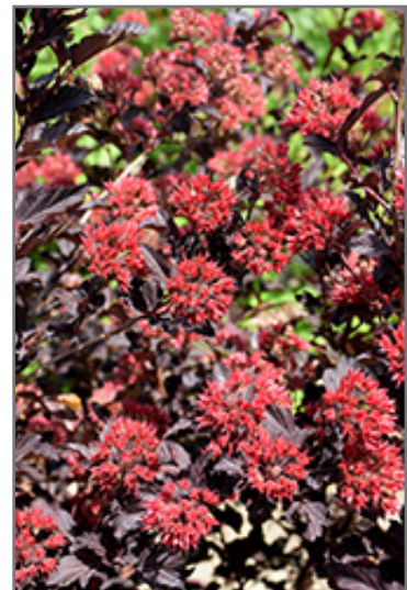
Centre Glow Ninebark fruit