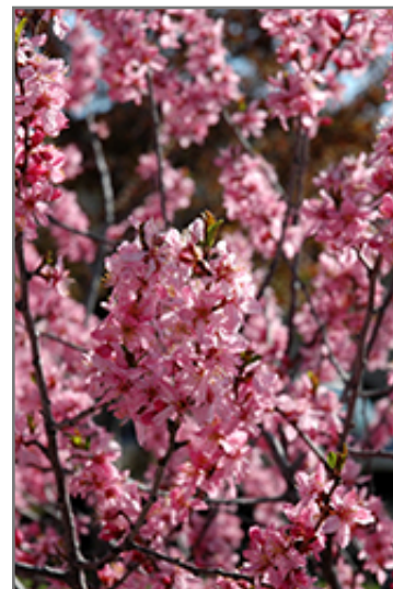
Muckle Plum flowers